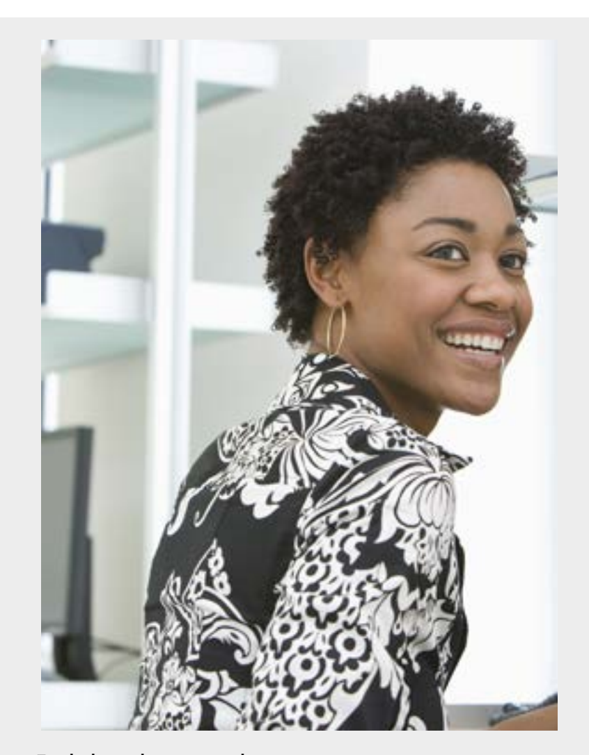
For help and support, please refer to your usual AXA contacts

A key area brought about by the Act is the new duty of fair presentation. We set out how we intend to assist customers with this aspect and we are working on a further document (to be available shortly) that will provide more detail on underwriting matters that may be relevant to this new duty.